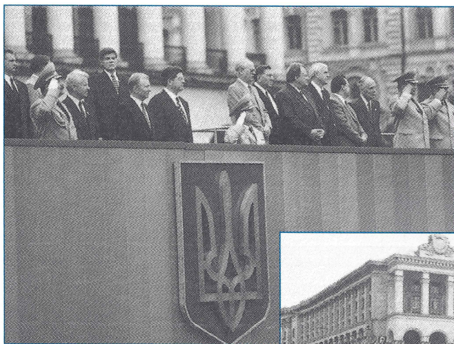
Reviewing the troops.

Afternoons and evenings were spent attending street festivals, concerts, boating events on the Dnipro River. Closing the celebrations were spectacular fireworks from Kyiv's Independence Square and outdoor concert park "Spivochke Pole", the Singing Field.